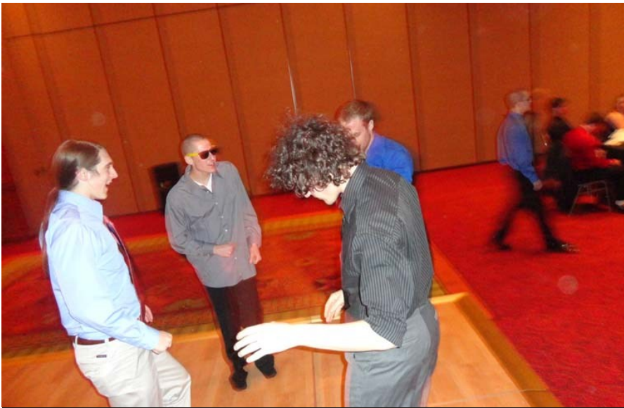
Last Black Diamond Formal - April 2012 (with some awesomely terrible dancing)